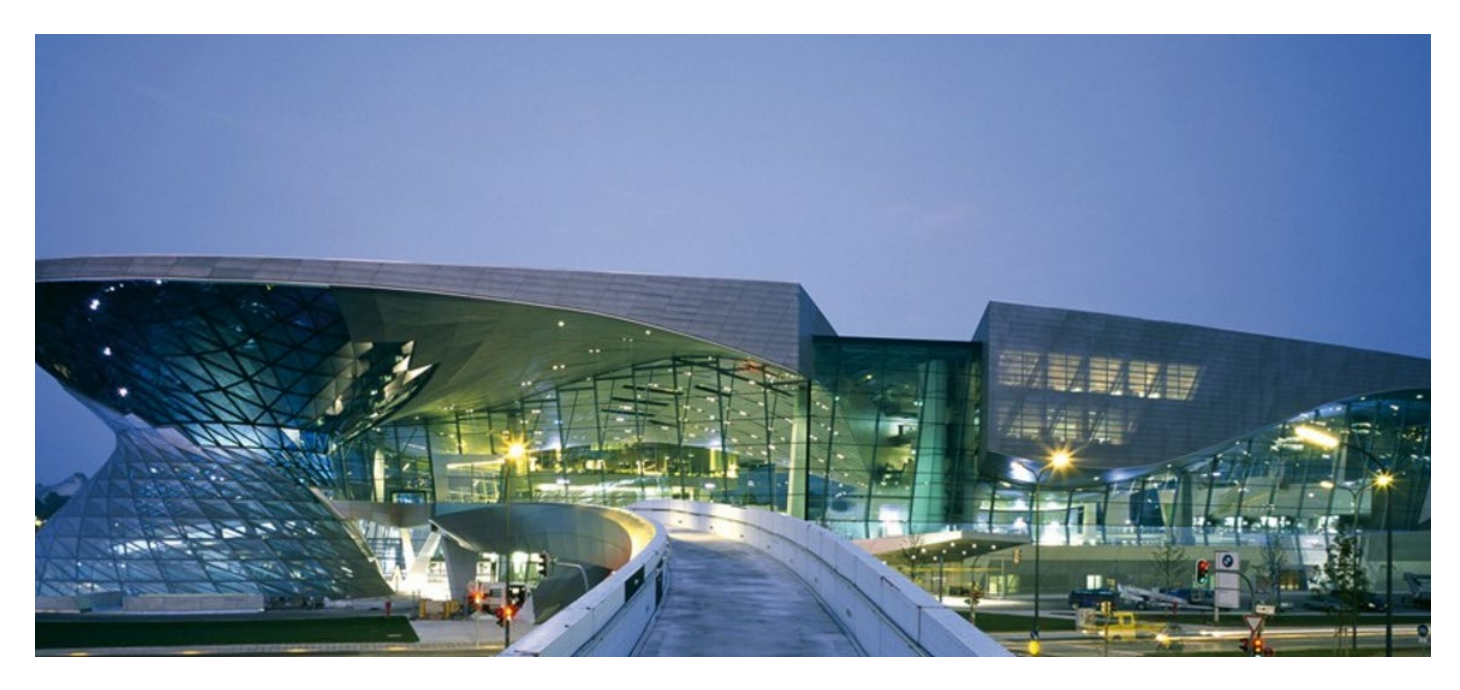
BMW Welt Munich