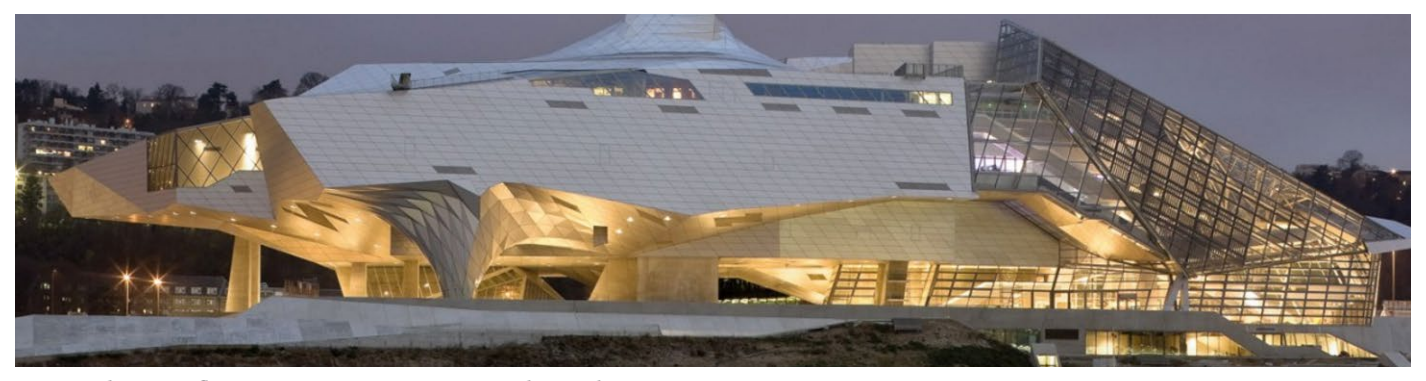
Musée des Confluences, Lyon

"We think of our architecture as part of the 21st century; as art which reflects and gives a mirror image of the variety and vivacity, tension and complexity of our cities."