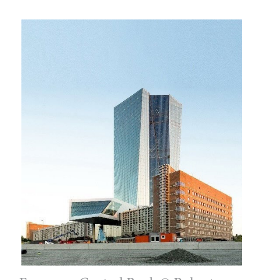
European Central Bank

These connecting platforms, bridges, ramps and stairs form a network of links between the office towers. They create short paths between the individual office floors in each tower and thus enable larger, interconnected usable office spaces on one or more floors in both towers, thereby also promoting informal communication.